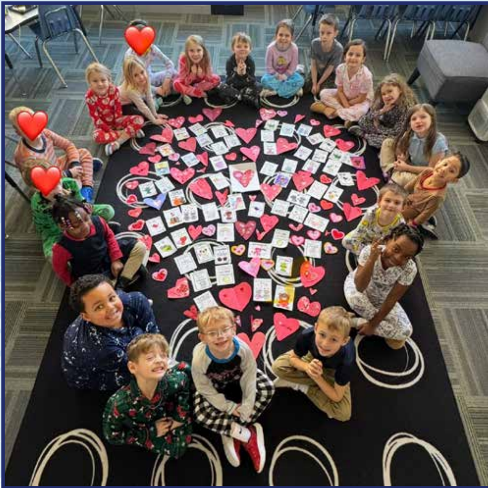
The first-graders (on pajama day), crafted valentines for Meals for Wheels.

Acts of Service (Well... kindness, really.)