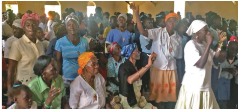
Members of our sister parish celebrate mass with music and dancing.